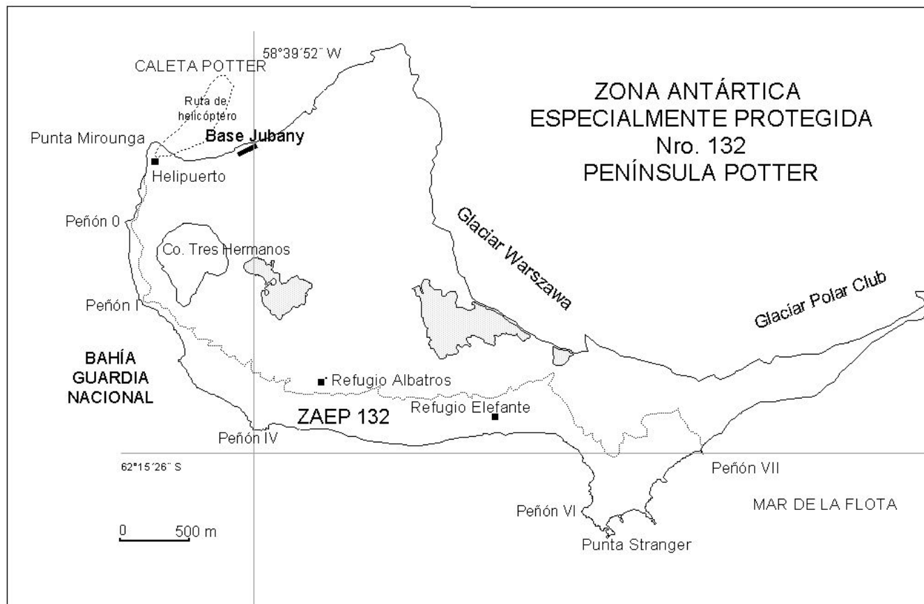
Map 3: Antarctic Specially Protected Area No. 132, Potter Peninsula (ASPA boundaries in finely dotted-gray lines; unnamed lakes in light gray)